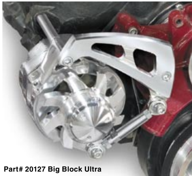
Part# 20127 Big Block Ultra

Part# 20127 Ultra Big Block Fits long water pump Chevys